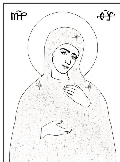
Mary: Love Forever Being Born